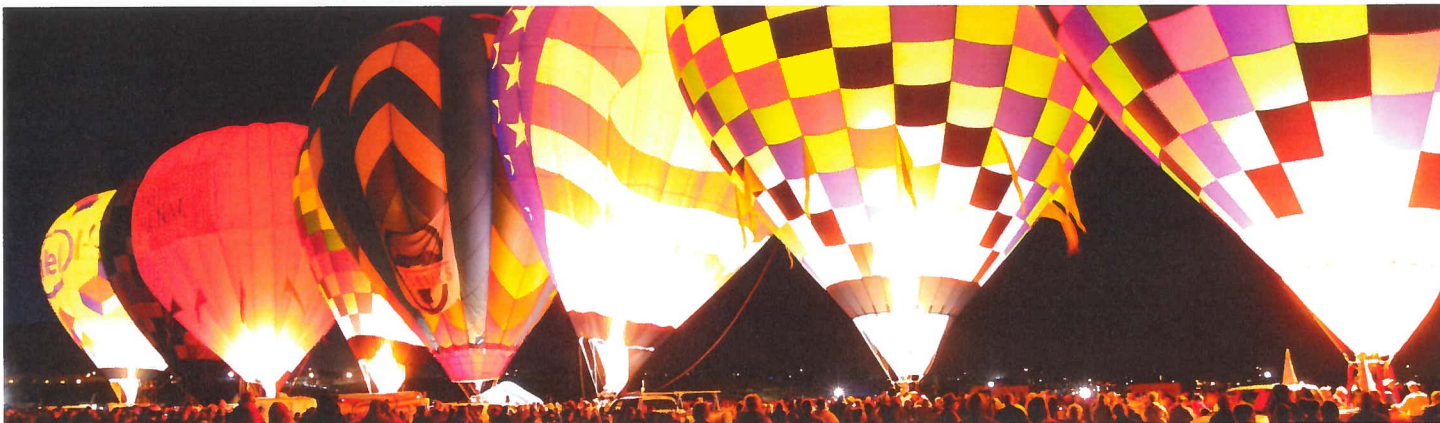
The brilliant colors of the Balloon Glow

began with 13 balloons and has grown to more than 600 balloons from all over the world. View the “mass ascension” of these specially shaped balloons as they lift off at sunrise. There is free time today to explore Old Town. Tonight, head to the Indian Pueblo Cultural Center for a private tour followed by dinner and an exclusive live performance of a Native American dance troupe in the Center. Meals: B, D